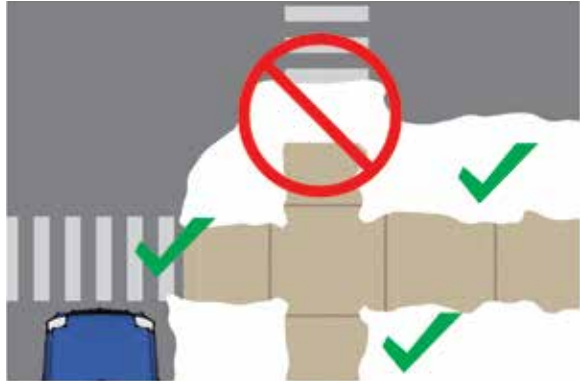
Do not push snow from driveways or sidewalks into the street or over crosswalks.

DO NOT push snow into the street, bike lanes, crosswalks, bus stops, train stations, alley entrances, or Divvy stations.