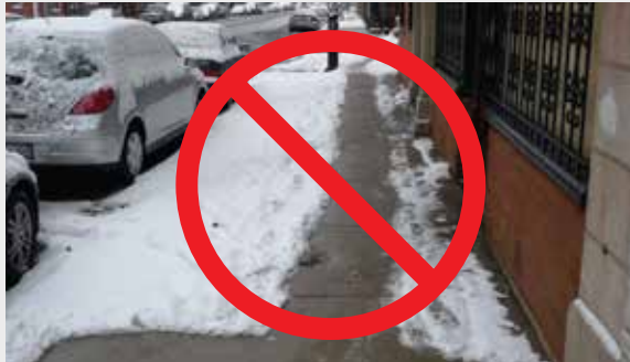
This path does not meet the width required in the city code.