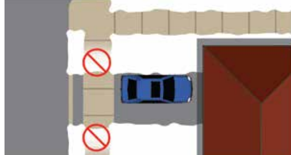
When clearing driveways or walkways do not block the sidewalks with snow.