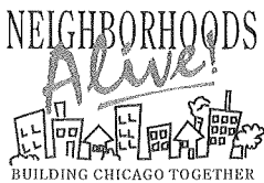
Christine Raguso Acting Commissioner