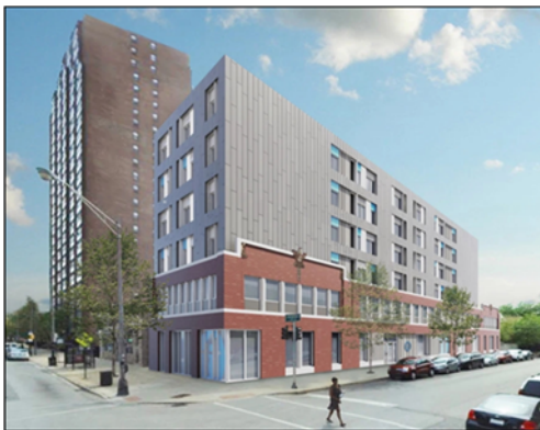
This mixed-use development on the southwest corner of Sheridan and Leland will provide 38 units of permanent housing, along with upgraded space for a 50-bed interim housing facility that has been operated by Sarah’s Circle in Uptown since 2011.

The six-story building will include dining and laundry facilities, a computer lab and onsite case management services. The complex will also contain a fifty-bed interim shelter providing temporary housing, food, and other basic supportive services for people in need. An existing vintage building on the site will be razed to make room for the new facility; some of the original terra cotta features from that structure will be preserved and incorporated into the design by the architectural firm of Perkins+Will.