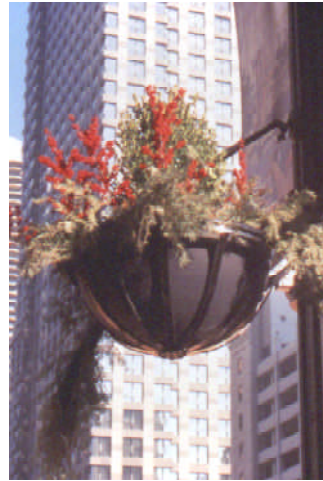
Figure 4.3.47 Hanging planters add greenery and keep sidewalks open