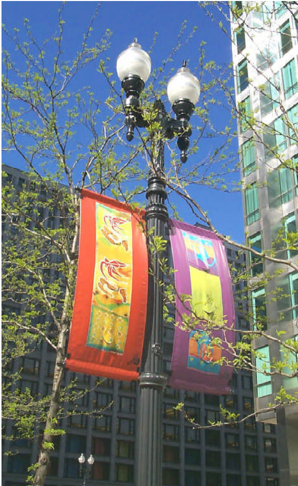
Figure 4.3.46 Dearborn Street Lights and landscaping in the Loop