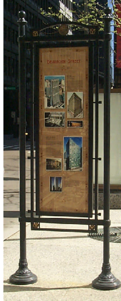
Figure 4.3.49 Street signage explains local points of interest