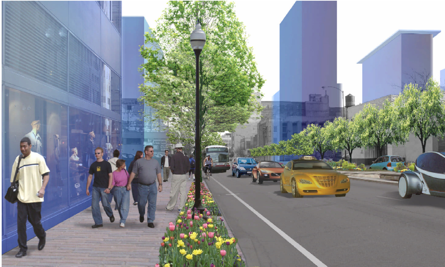
Figure 4.3.50 Michigan Avenue, looking south from Roosevelt Road, in 2020. South Michigan Avenue will be a landscaped street connecting the Near South district to the Loop. It will be a major pedestrian, bicycle and transit corridor.