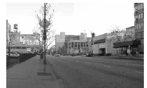
Figure 4.3.51 Michigan Avenue today.