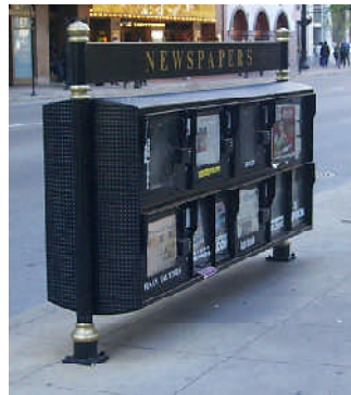
Figure 4.3.48 Randolph Street Consolidated newspaper rack