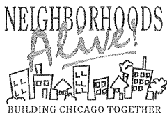
Christine Raguso Acting Commissioner