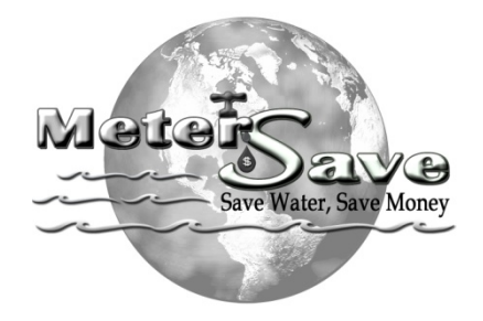
Save Water Save Money!

Please go to <u>www.metersave.org</u> By phone call 3-1-1, or 312-744-4H2O.