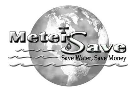
Save Water Save Money!

Please go to <u>www.metersave.org</u> By phone call 3-1-1, or 312-744-4H2O.