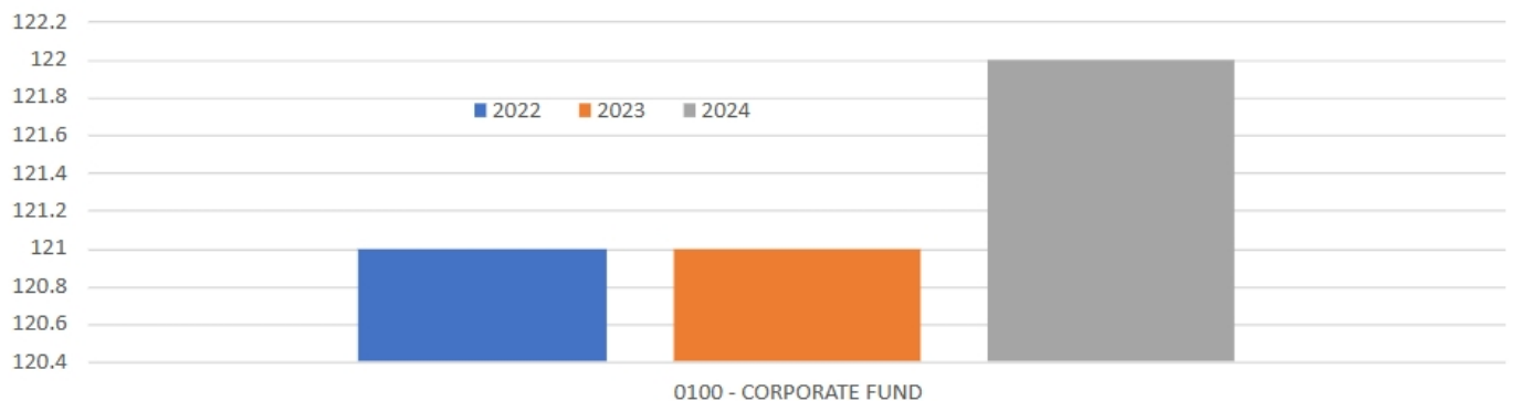
FTEs by Funding Type and Year