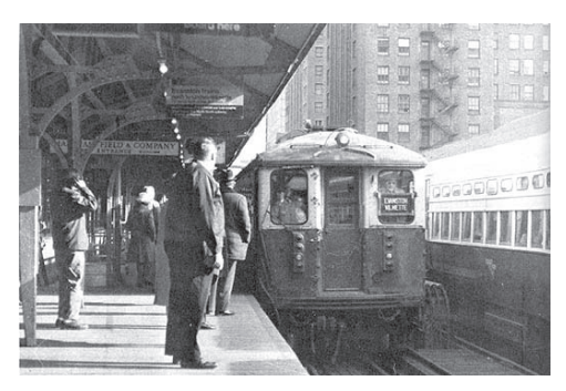
Historic Photo of the Randolph/Wabash Station

For more information, please contact the Chicago Department of Transportation at (312) 744-3520 cdotnews@cityofchicago.org | www.cityofchicago.org/transportation