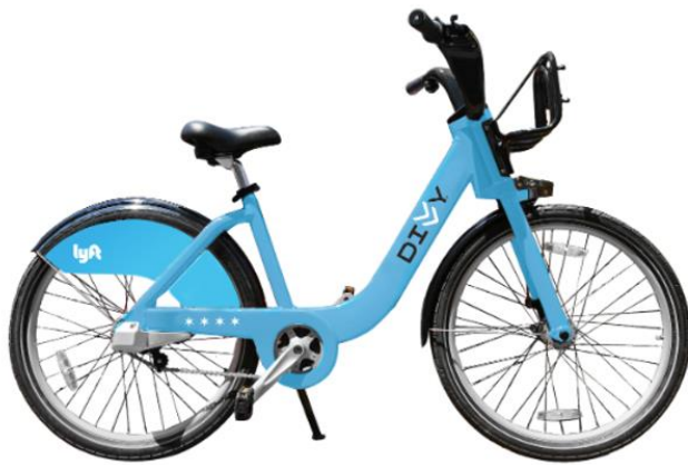
Divvy Classic Bike .....