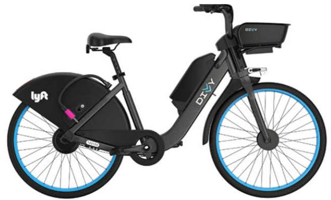
Divvy E-Bike .....