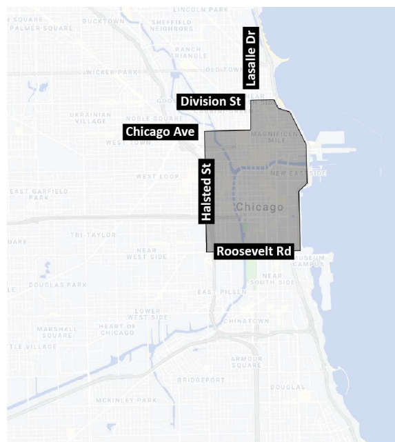
Central Business District