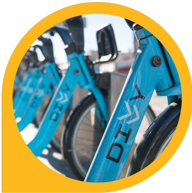
TABLE 2: DIVVY OPERATIONS UPDATE

Chicago's Divvy bike share program utilizes the extensive data collected on micromobility to constantly improve operations. Early this year, CDOT staff visited all Divvy stations over 7 years old – over 500 stations! – to assess conditions. CDOT combined those assessments with data on ridership, maintenance costs and amount of time stations were empty or full to create a list of recommendations on improving station locations by expanding them, moving them, or upgrading them.