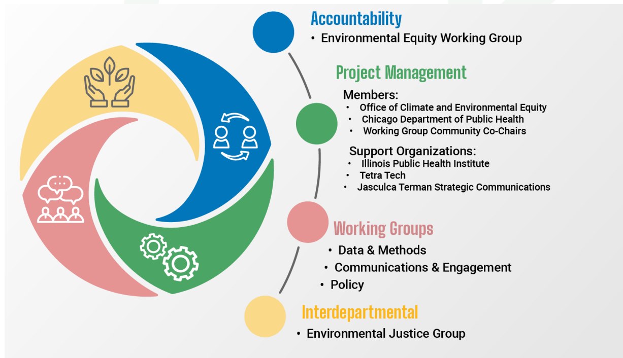
Figure 2: Cumulative Impact Assessment Project Structure

Under the Cumulative Impact Assessment project structure ultimately adopted (see figure below), the EEWG provided guidance on how the assessment should be conducted and served as the accountability body throughout the process. Three working groups, each co-chaired by representatives from CDPH and the EEWG, were formed for Data & Methods, Communications & Engagement, and Policy, and tasked with producing specific assessment deliverables. CDPH and OCEE established an Interdepartmental Environmental Justice Work Group to engage the various City departments that have authorities and responsibilities related to environmental protection. A Project Management Team consisting of representatives from each of the working groups, along with subcontracted organizations, provided day-to-day oversight and support to working groups to ensure that the assessment was carried out successfully.