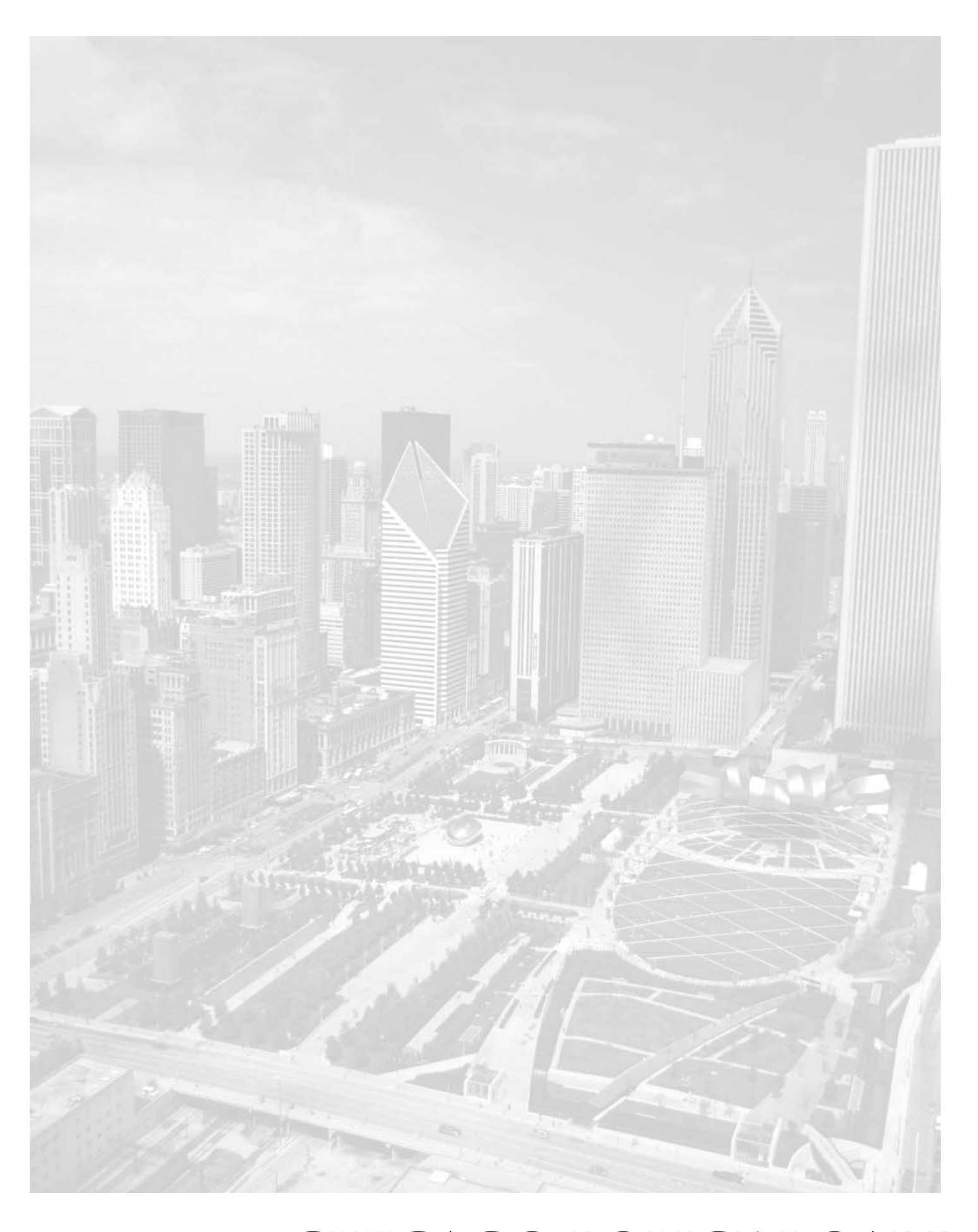
CHICAGO POLICE BOARD