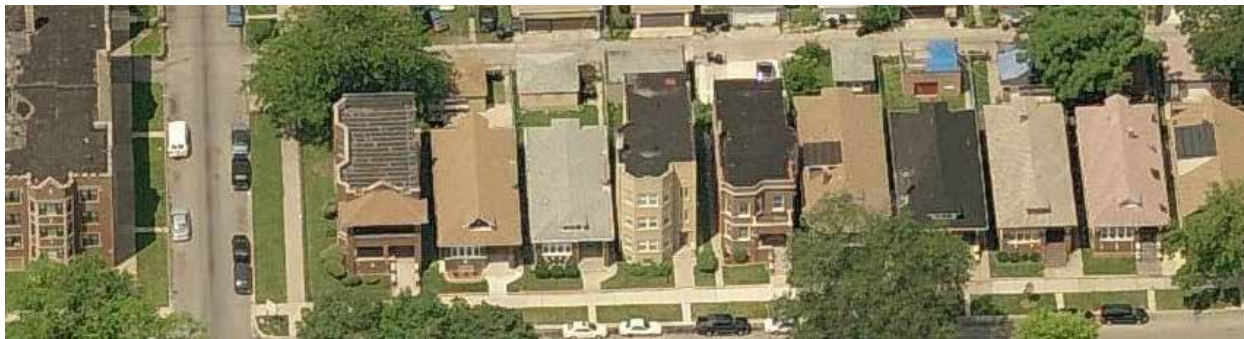
W 81st St between S Wentworth Ave and S Yale Ave