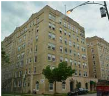
Multi-unit building, Washington Blvd & Central Ave

But the West Side Planning Area is much more than facts and figures. This is where some of the city's earliest and strongest not-for-profit development corporations - such as Bethel New Life and the Lawndale Christian Development Corporation - were established and where some of the most important