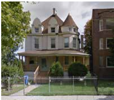
500 block of N Parkside Ave