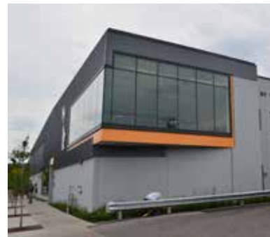
By the Hand Boys & Girls Club, Central Ave & Lake St

Boundary Street to S Boundary Street, and from W Boundary Street to E Boundary Street