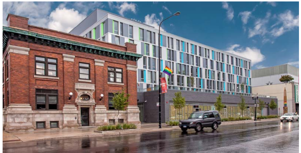
after photo