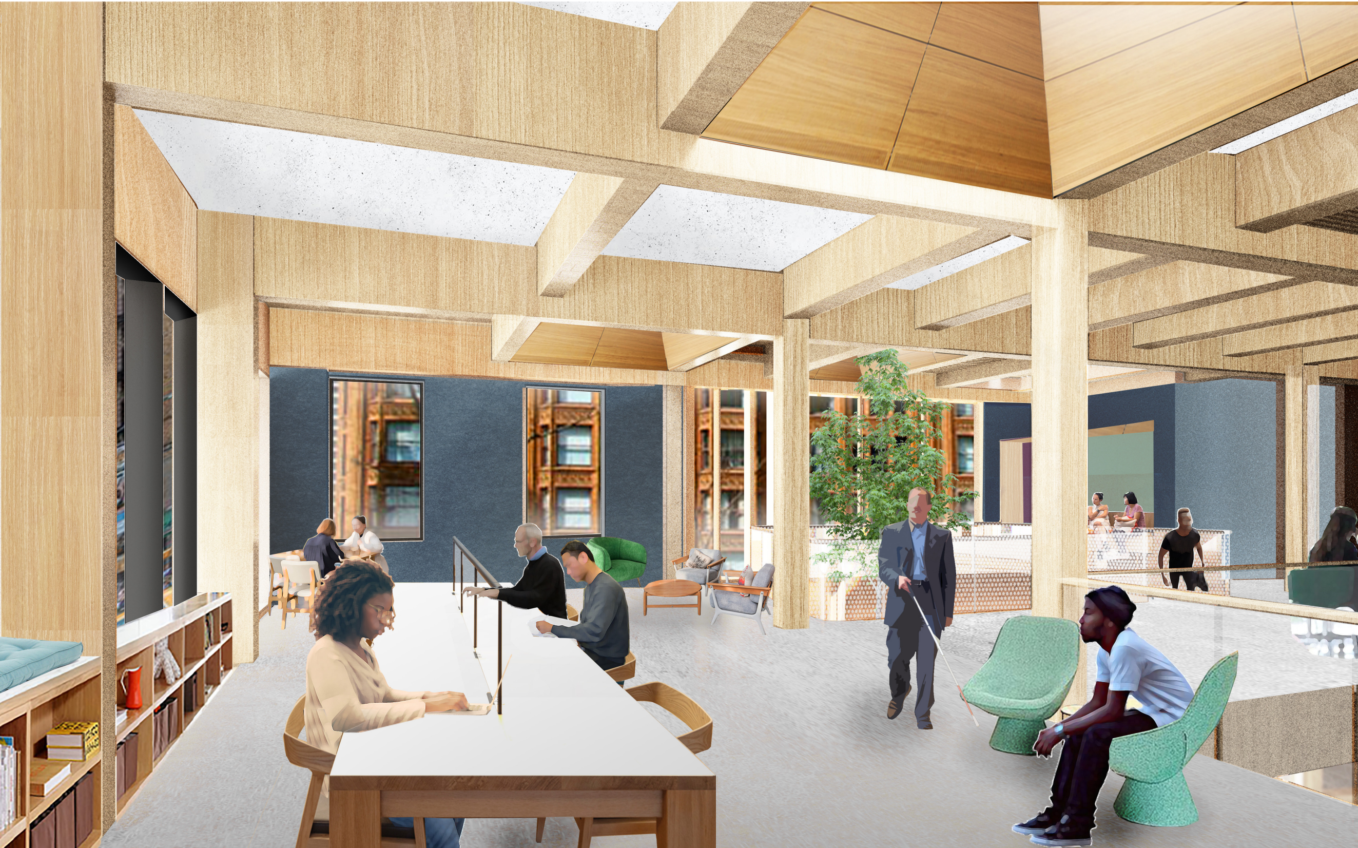
A multi-functional lounge on the second floor provides space for meeting, counseling, learning, for everyday use. It also serves as a cooling and warming refuge in extreme weather.