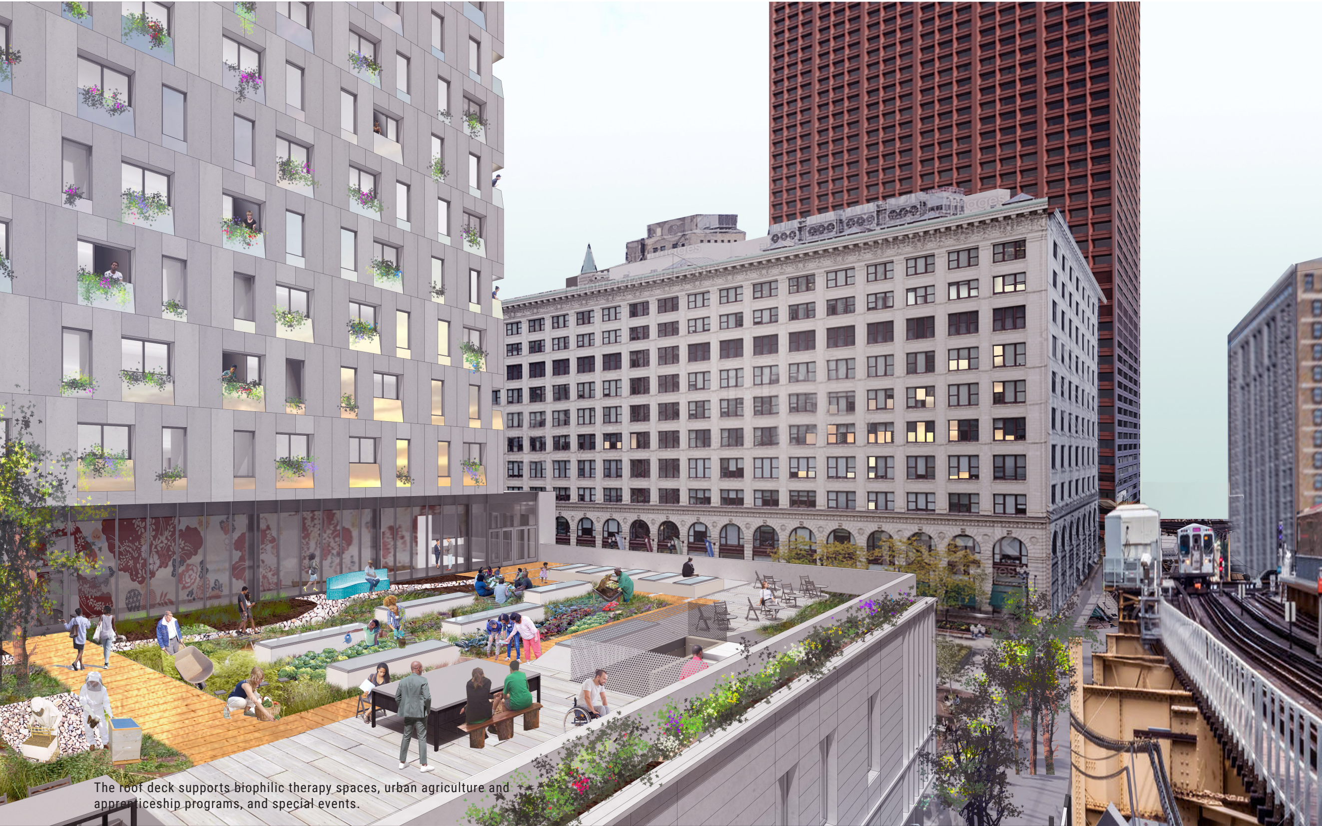
The roof deck supports biophilic therapy spaces, urban agriculture and support healthy programs, and special events.