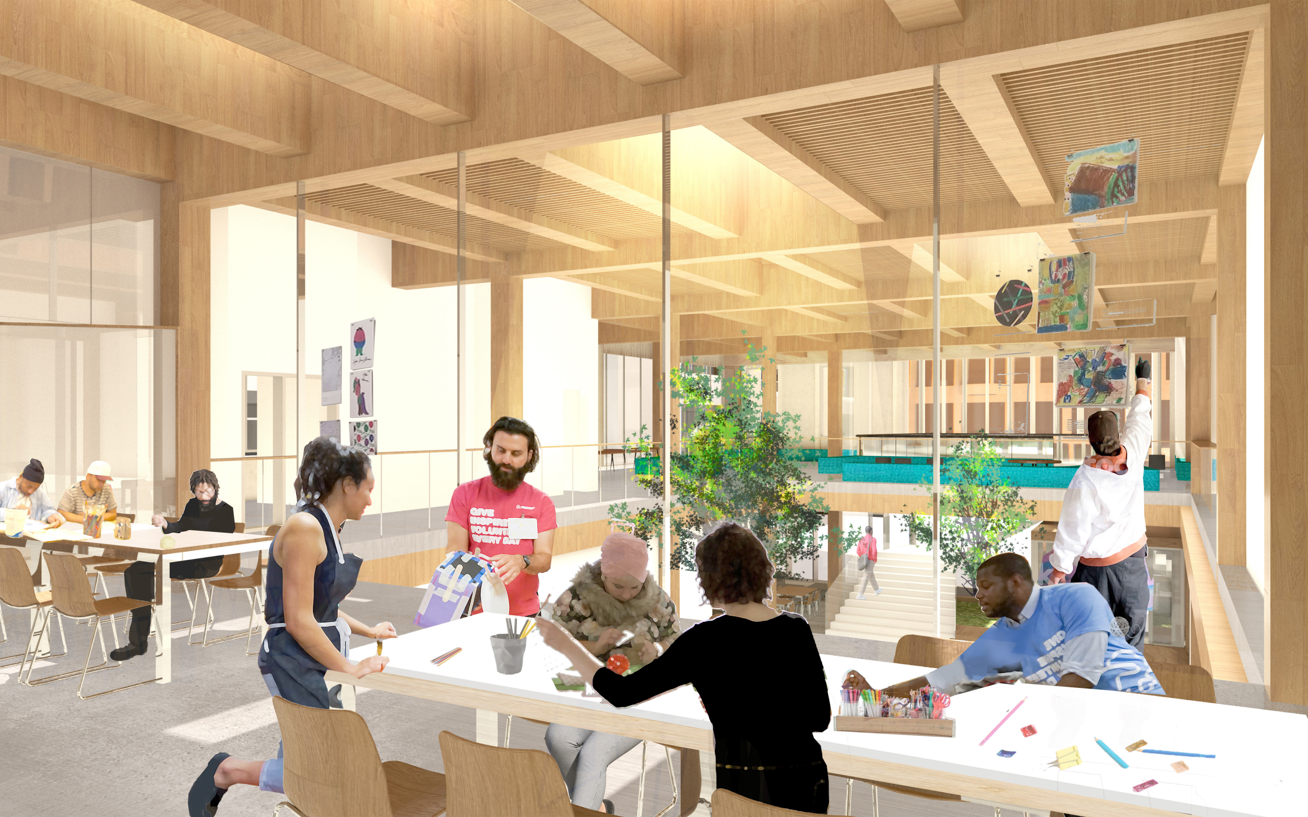
A Studio for community arts and Artist-in-Residence creates an inviting environment for healing, creativity, and connection.