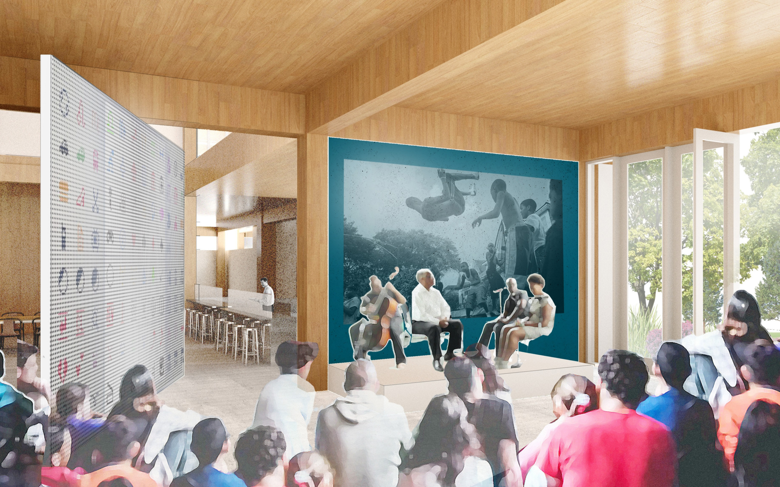
A flexible gallery space hosts arts and cultural events and connects to the adjacent Pritzker Park. Its highly visible location positions it to encourage positive public dialogue and overcoming social isolation.