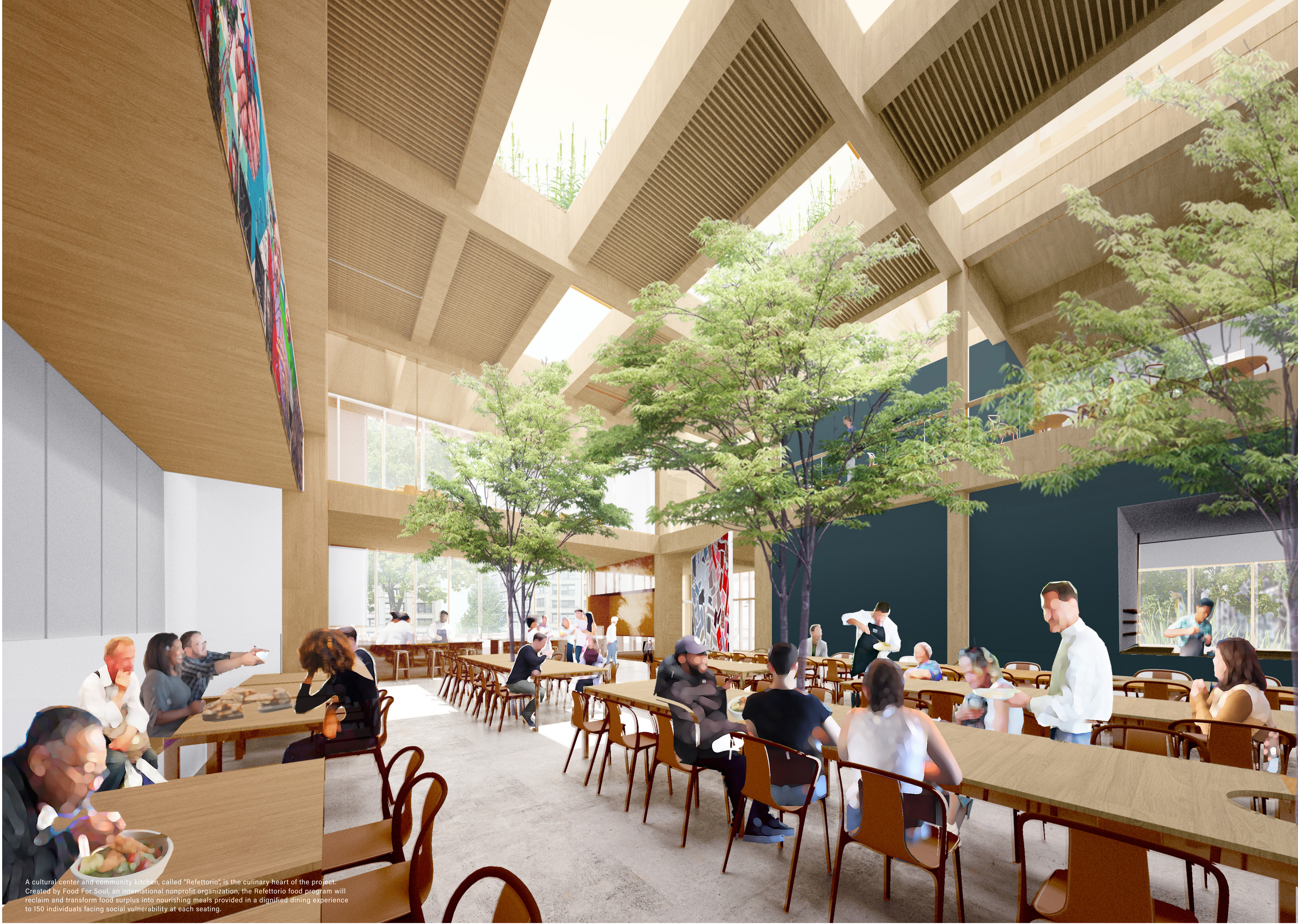
A cultural center and community kitchen, called "Refettorio" is the culinary heart of the project. Created by Food For Soul, an international nonprofit organization, the Refettorio food program will reclaim and transform food surplus into nourishing meals provided in a dignified dining experience to 150 individuals facing social vulnerability at each seating.