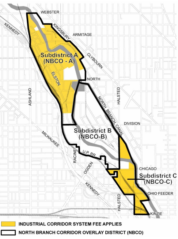
Figure 1: Conversion areas in the North Branch Corridor Overlay District

The Industrial Corridor System Fee will be charged per square foot of a proposed development's net site area. Net site area includes all of the land within the boundaries of a development site, less the area of all land required or proposed for public use and not used for the purpose of calculating floor area ratio or other bulk and density regulations. The fee would be based on a portion of the estimated cost to replace industrial property lost to non-industrial redevelopment. The full cost to replace industrial property is set by the Department of Planning and Development and currently estimated at $49.00 per square foot. The cost is based on an analysis of recent property sales and case studies of industrial projects within the Industrial Corridor system, citywide estimates of average environmental remediation costs, and industrial street rehabilitation costs. Applicants will only pay 25%, or "Developer's Share", of this cost.