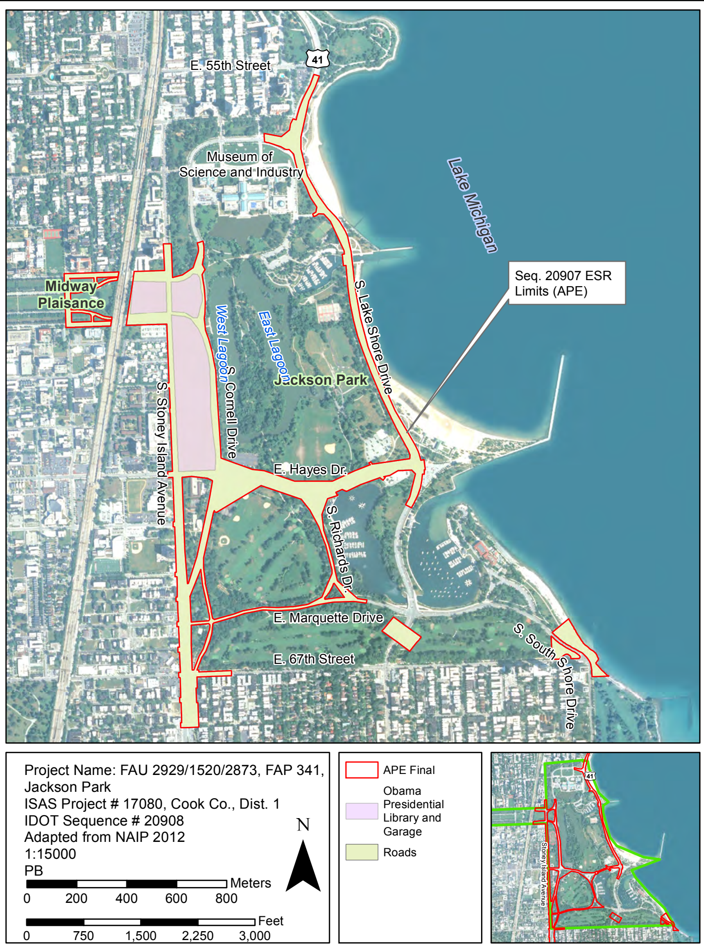
Figure 1. SLFP (IDOT Seq. 20908) Area of Potential Effects.

ISAS Memo, Supplemental SLFP Criteria, IDOT Seq. 20908