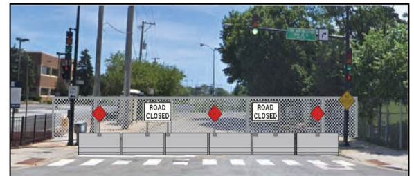
Proposed concrete barriers and fencing blocking pedestrian access to the north walkway leading to the 27 th Street Metra Station.

(See Metra Station pedestrian access map to the left. )