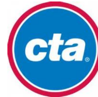
Chicago Transit Authority