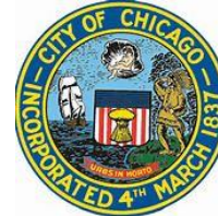
City of Chicago