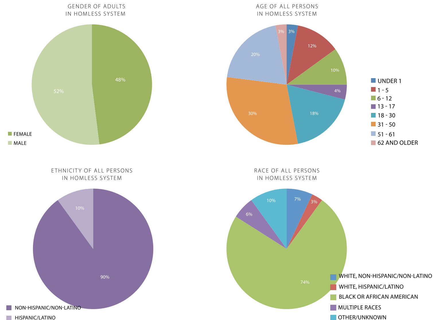
Figures 4 – 7: Demographic Characteristics of People Served by Chicago’s Homeless Assistance System 6 (Source: Homeless Management Information System, 10/1/10 – 9/30/11)

In addition to those served by the homeless assistance system or those who are sleeping on the streets, many households are precariously housed or living doubled up with family or friends. This is a challenging population to measure, but one benchmark is the data collected by Chicago Public Schools (CPS). In comparison to HUD, the U.S. Department of Education uses a broader definition of homelessness that includes living doubled up: “sharing the housing of other persons due to loss of housing or economic hardship.”