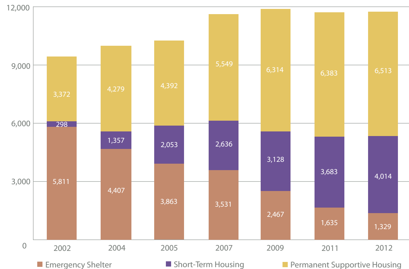
Figure 1: Chicago Housing Inventory by Program Type 2002-2012 (Source: Housing Inventory Chart, 2002-2012 2 )

Chicago achieved significant outcomes under the first Plan to End Homelessness: Getting Housed, Staying Housed . Developed through a comprehensive community process and endorsed by Mayor Richard M. Daley in 2003, the Plan called for a fundamental shift from an emergency shelter-based strategy to a housing-focused strategy in order to not simply manage homelessness but to end it. Chicago’s innovative Plan won a 2004 award from the National Alliance to End Homelessness in Washington, D.C., whose president called it “the most comprehensive and cutting-edge 10-year plan in the country.” As figure 1 illustrates, the Plan was successful in converting Chicago’s resources from the temporary solution of emergency shelter to the permanent solution of housing. The ratio of emergency shelter to permanent housing has flipped since implementation of the Plan, even while increasing the overall number of housing options available to people experiencing homelessness.