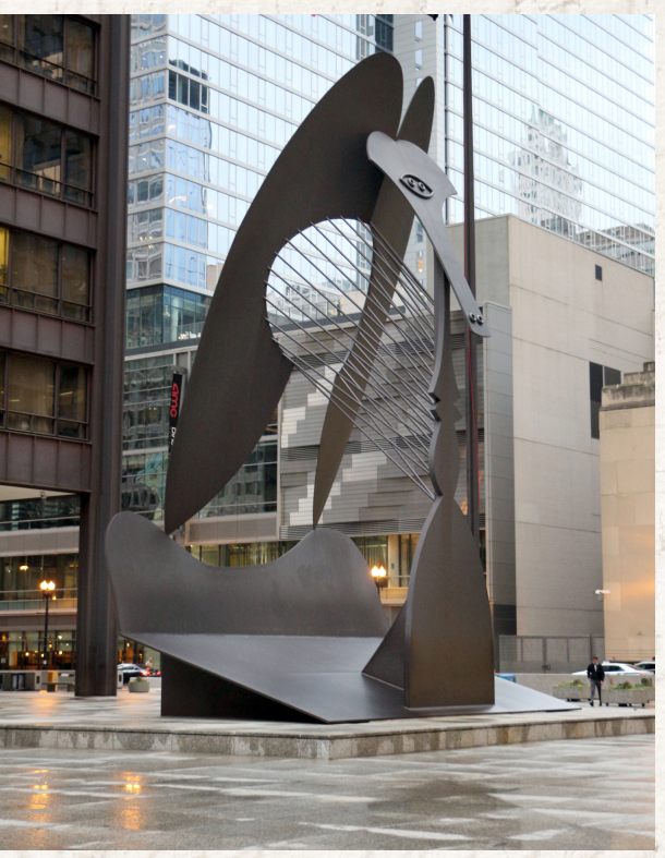
https://commons.wikimedia.org/wiki/File:Pablo_picasso,_Chicago_Picasso, _1967.jpg Sailko, Pablo Picasso, Chicago Picasso, 1967.

walkway along the river side of the building.