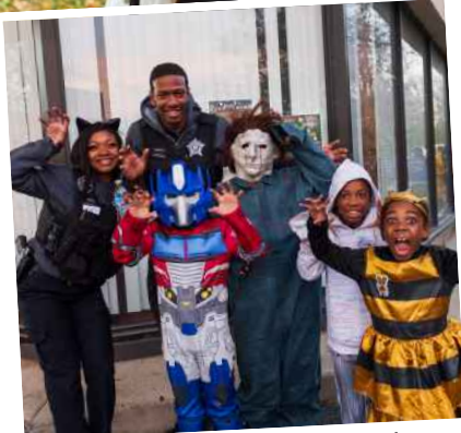
HallowHooD | Lost Boyz & South Shore Partners October 2024