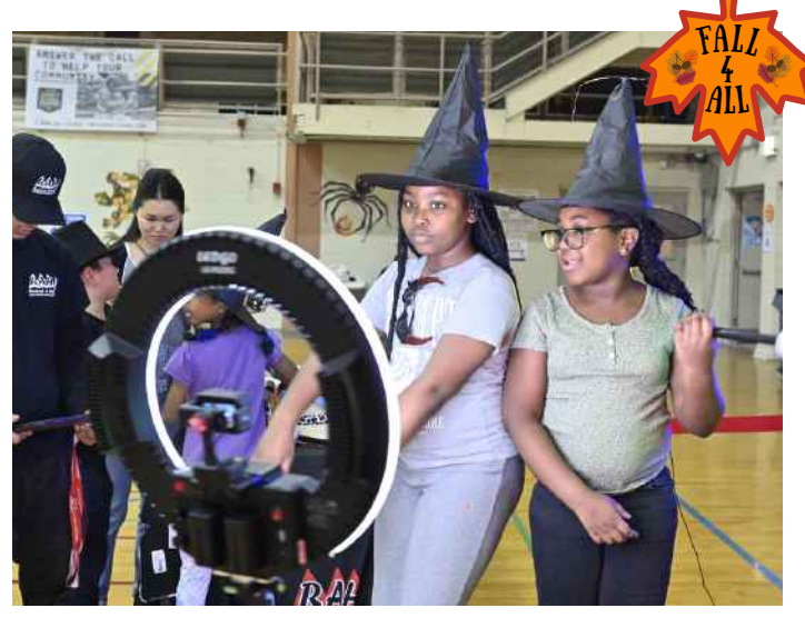
48th Ward Fall-4-All Event Broadway Armory Park | October 2024

The City of Chicago Mayor's Office and Community Safety Coordination Center (CSCC) partnered with community-based organizations on eight "Fall-4-All" activations during Chicago Fall Fest. Community leaders were central in the event planning, coordinating events with a haunted house, trunk or treat, pumpkin carving, and movie night, among other activities. The City provided additional resources such as food trucks, fun activations, resource fairs, and more. Over 3,800 residents attended these events.