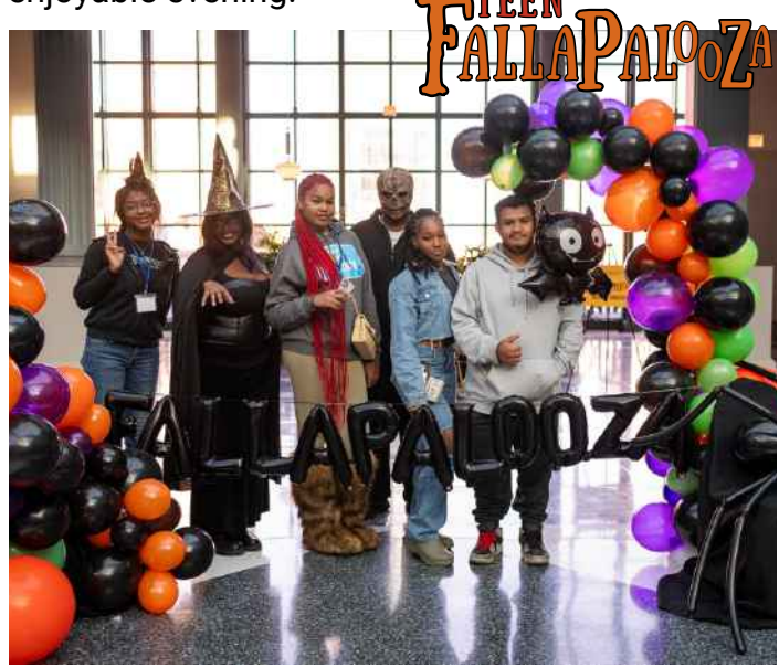
Teen Fallapalooza Harold Washington Library Center | October 2024

Teen Fallapalooza, a new event for teens ages 14-19, kicked-off Fall Fest at the Harold Washington Library Center Winter Garden. This fun, safe party for teens included a 360 camera, a silent movie screening, crafts, music and dancing, food, and more. Fallapalooza was planned in partnership with youth employees from the Safe Spaces for Youth Program and drew 275 teens downtown for a safe and enjoyable evening.