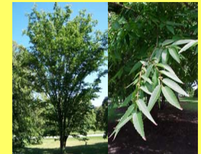
Village Green Zelkova ( Zelkova serrata 'Village Green' )

Blackhaw may be grown as a large, upright, multi-stemmed shrub or as a small, single trunk tree. Non-fragrant white flowers appear in spring. Its colorful fruit, berry-like drupes, often persist into winter and are colorfully attractive over the course of the year.