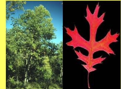
Hill's Oak ( Quercus ellipsoidalis )

This magnolia, named for its green, warty, cucumber-like fruits, grows to 40-60 feet and produces slightly-fragrant, greenish-yellow, tulip-like flowers at the twig tips in late spring.