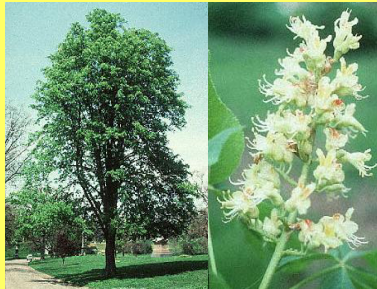
Yellow Buckeye ( Aesculus Flava )

A large upright oval tree that can reach 75 feet in height. This native tree is insect and disease resistant in urban conditions. The Buckeye is a magnificent addition to the landscape and attracts birds and wildlife.