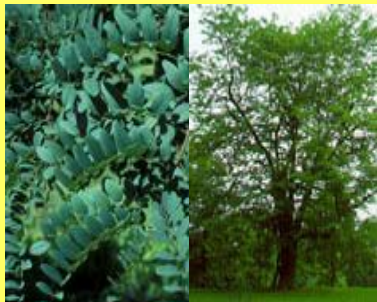
Chicago Blues Black Locust ( Robinia pseudoacacia )

Hill's oak grows to a height of 60-75 feet, with a trunk diameter of up to 2 feet. The tree is found on dry, sandy sites, dry upland woods, and occasionally on slopes. In Illinois, it is present only in the northern-most tier of the state.