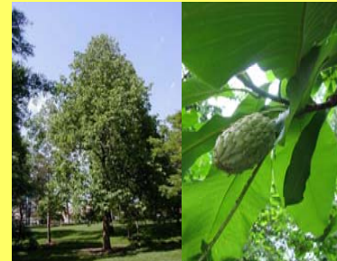
Cucumber tree ( Magnolia acuminata )

A good urban tree because of its ability to tolerate drought, heat, confined and poor soils. Grows slowly at first but once established is vigorous and can reach 100' tall! Ginkgos have survived for millions of years.