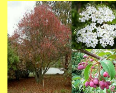
Blackhaw ( Viburnum prunifolium )

This tree has the characteristically attractive pyramidal shape of most lindens, but it's leaves are distinctively toothed. It also has the added benefit of attractive flaking bark. This tough and durable tree makes a fine street tree growing to 40-45 feet tall.