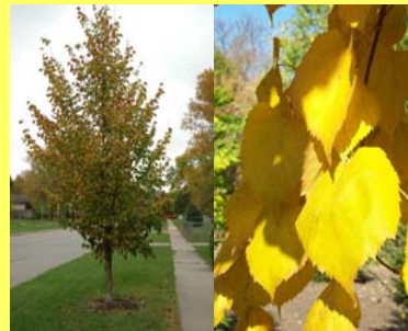
Harvest Gold Linden ( Tilia mongolica 'Harvest gold' )

A native tree that can reach 70 feet high, is widely planted in parks and on city streets. It's red fibrous bark and fine leaves provide textural variety. The Cypress's ability to withstand wind-storms and drought assures it's popularity as an urban tree.