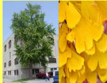
Ginkgo / Maidenhair Tree ( Ginkgo biloba )

Excellent for city streets, Hackberry and can grow to 50-70 feet in height and is distinguished by strikingly warty bark. The tree likes full sun, is easily transplanted, and performs well under adverse conditions.