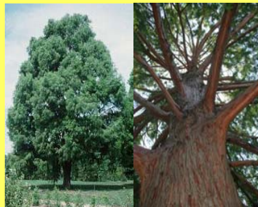
Bald Cypress ( Taxodium distichum )

A locally cultivated tree that is resistant to borers. The flowers are fragrant and contribute to honey production by bees. Chicago Blues Black Locust is a great tree for difficult sites; transplants well and is drought and salt tolerant.