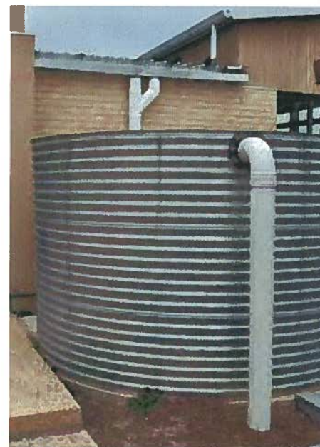
Rainwater collection system

General considerations for reuse of onsite sources of water include the quality constraints of the source and the potential types of treatment that may be needed to meet the quality needs of the proposed end use. Although every situation is different, Tables 8-1 6 and 8-2 7 provide guidance on typical considerations.