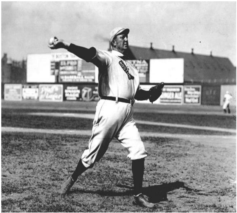
CY YOUNG IN ACTION

Do you wonder what was happening in 1890? That's the year the old water main was installed beneath your street. Among other things: