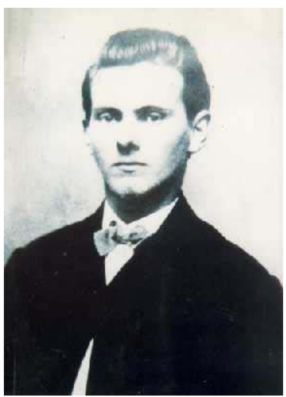
OUTLAW JESSE JAMES

Do you wonder what was happening in 1875? That's the year the old water main was installed beneath your street. Among other things: