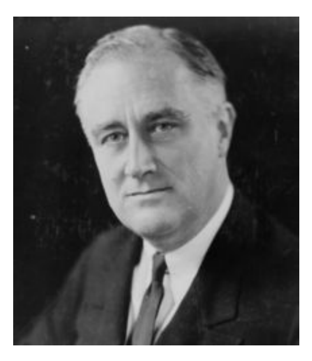
FRANKLIN D. ROOSEVELT

Do you wonder what was happening in 1882? That's the year the old water main was installed beneath your street. Among other things: