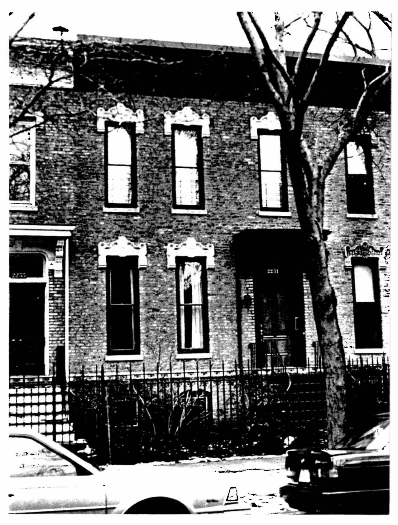
The row house at 2231 N. Burling St., shown above in a 1992 photograph, has the distinctive physical features of the houses in the Burling Row House District, including tall, narrow windows, stone lintels, and wood cornice.