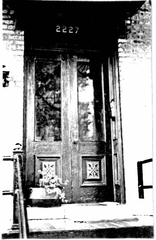
The Burling Row Houses have exceptionally fine detailing, including (clockwise, from top left): a wood cornice and stone lintels, ornate keystones, paneled doors and door frames, and "pent-style" porch roofs.