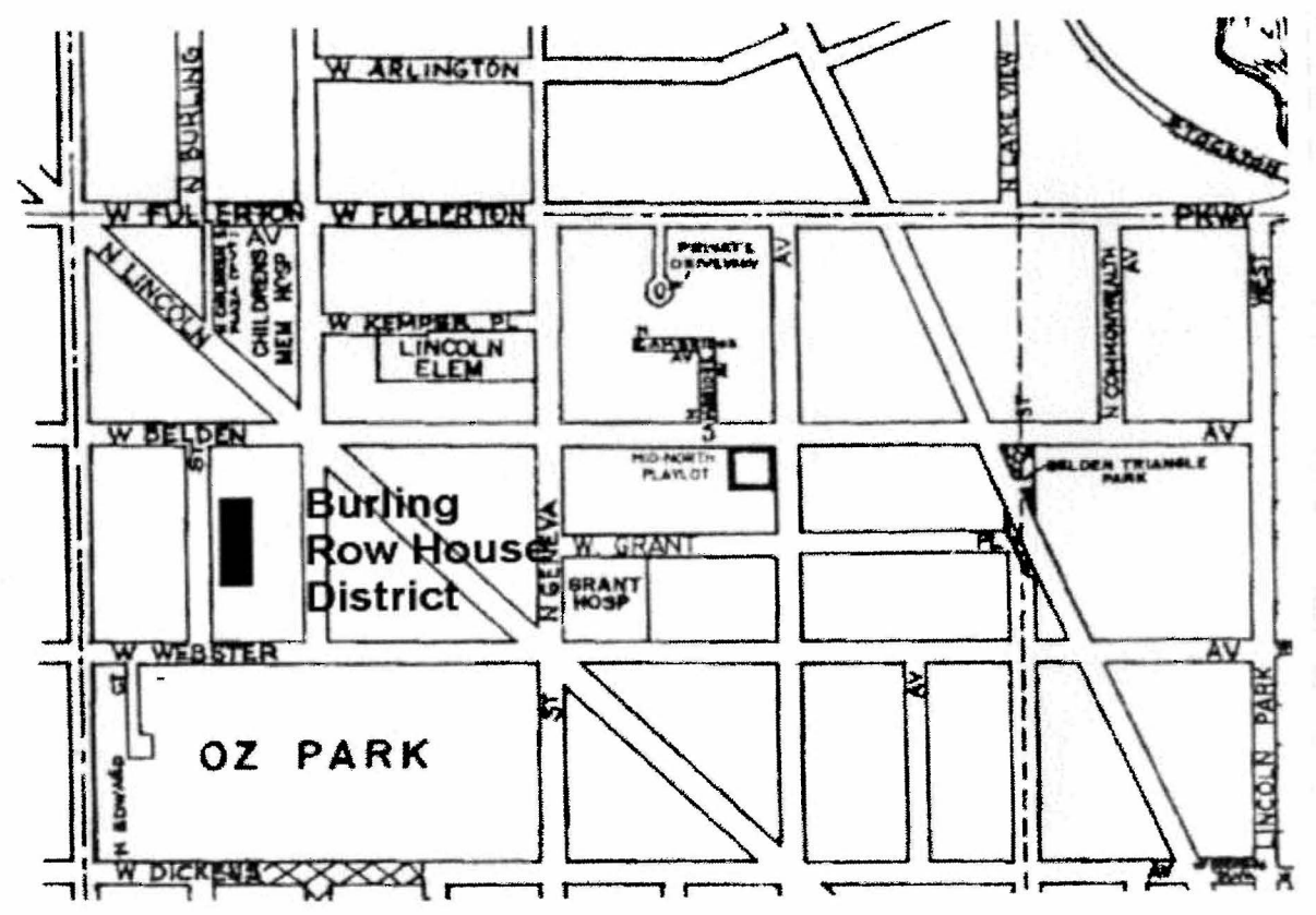
Above: The Burling Row House District dominates a one-block stretch of Burling Street in the Lincoln Park neighborhood, between Oz Park and Children's Memorial Hospital.

Cover: The ten attached brick houses that comprise the district, built in 1875, form a distinctive Italianate-style row, ornamented by elaborate stone lintels and a continuous wood cornice, extremely rare for its age and physical intactness.