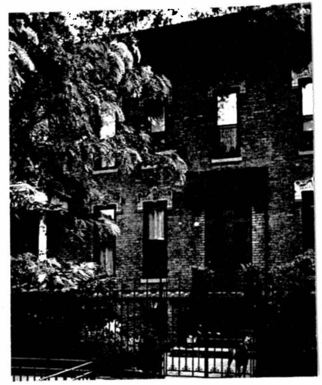
The Burling Row Houses were among the first masonry residences built to conform to the city's 1874 mandate for fireproof construction. The four end units project slightly (left), forming bookends for the tenunit ensemble.