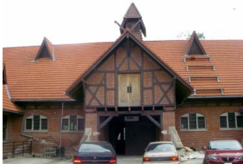
Bottom: Courtyard view of the Stable and hay loft in the south portion of the building.