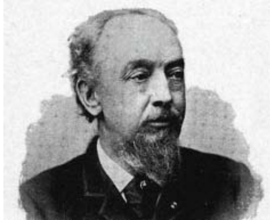
Top: After the West Chicago Park District was established in 1869, William LeBaron Jenney (1832-1907) was elected Architect and Chief Engineer for the District.