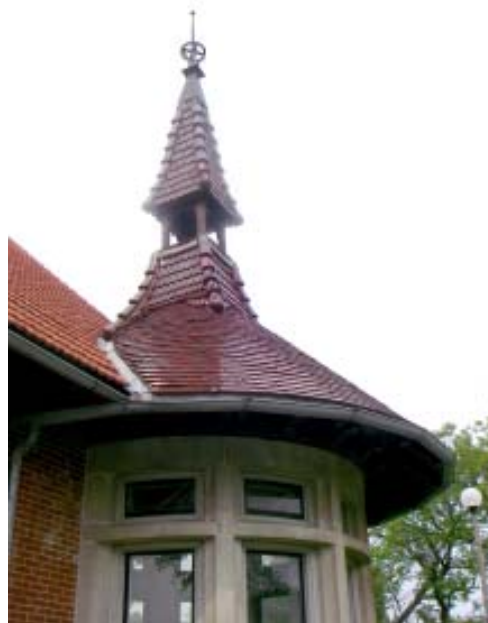
Middle Right: Detail of the pavilion's glossy clay tile roof and cut limestone window mullions.