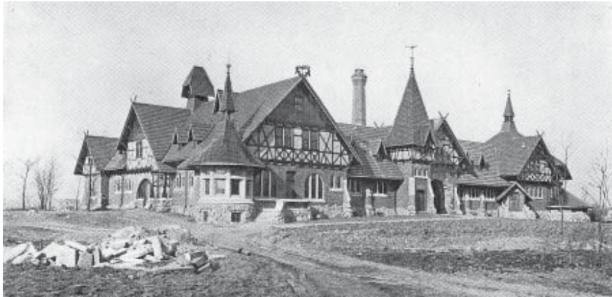
Top: Rendering of the Proposed Humboldt Park Receptory Building and Stable in 1895.