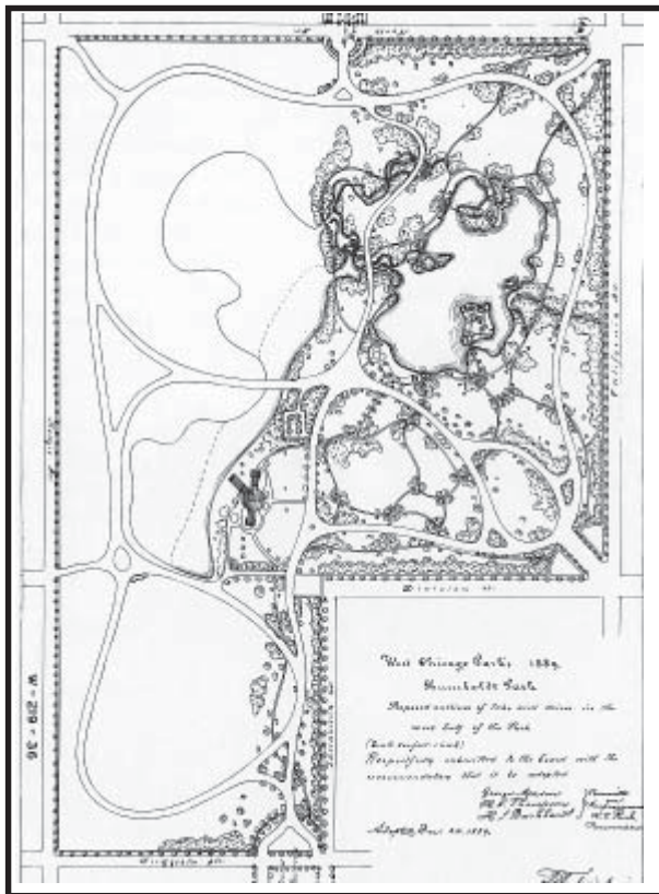
Middle: An 1889 map of Humboldt Park. The Chicago Fire slowed development of the park that when it officially opened in 1877, only the eastern 80 acres was completed.