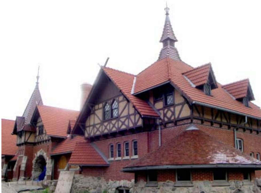
Top: The northeast pavilion of the Humboldt Park Receptory Building and Stable.