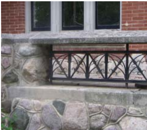
Middle Left: Detail of the pavilion's decorative wrought iron railing and its rusticated field stone porch.