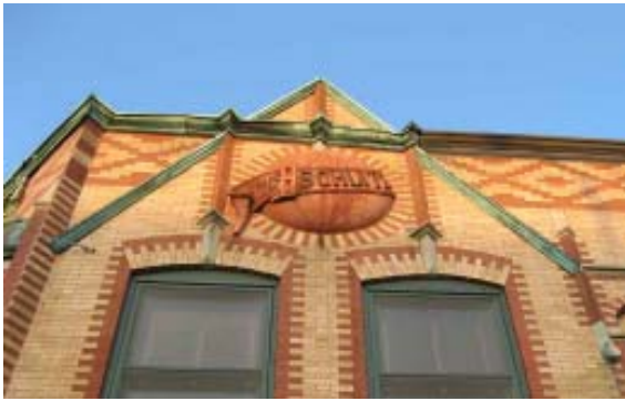
Bottom Left and Right: Schubas Tavern at 3159 N. Southport (1903) is a fine example of Frommann & Jepsen's many tavern designs for the Schlitz Co. Brewery, built to appeal to Chicago's German working-class population.