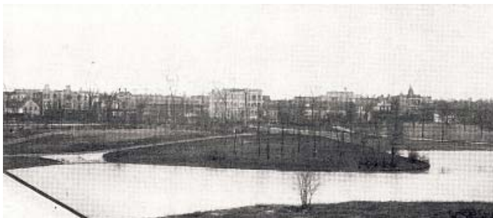
Bottom: A view of Humboldt Park in 1895.