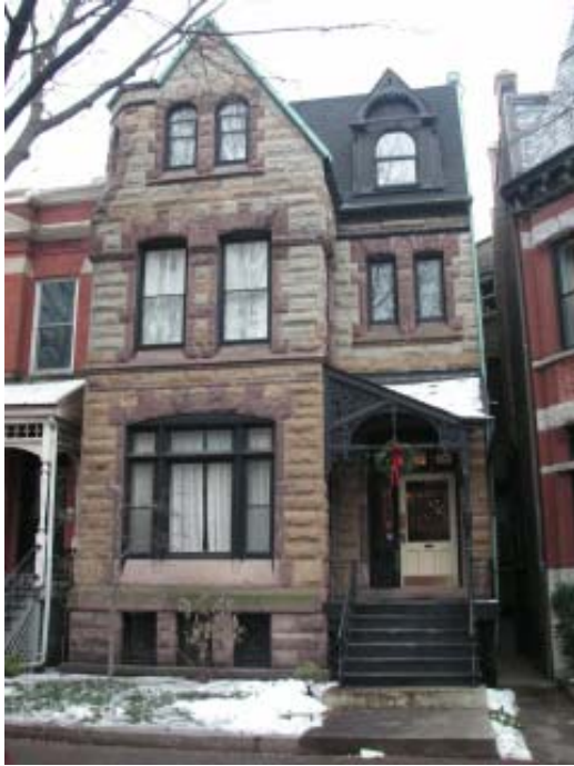
Top: 629 W. Fullerton Parkway (1889), part of the Mid-North Chicago Landmark District, is one of the early Queen Anne buildings produced by the architectural firm of Frommann & Jepsen.