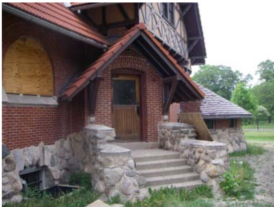
Bottom: The entrance to the northeast pavilion has an oversized roof-covered porch with rusticated field stone banisters.