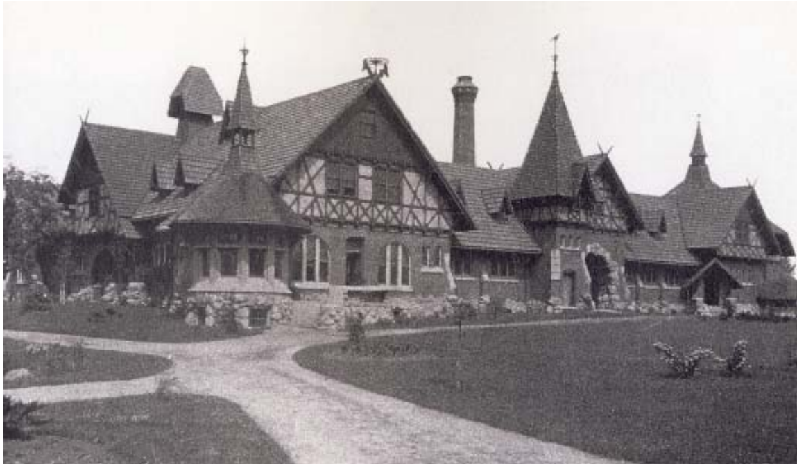
Top: Historic view of the Humboldt Park Receptory Building and Stable, ca. 1900. Bottom: A recent view of the building, ca. 1998.