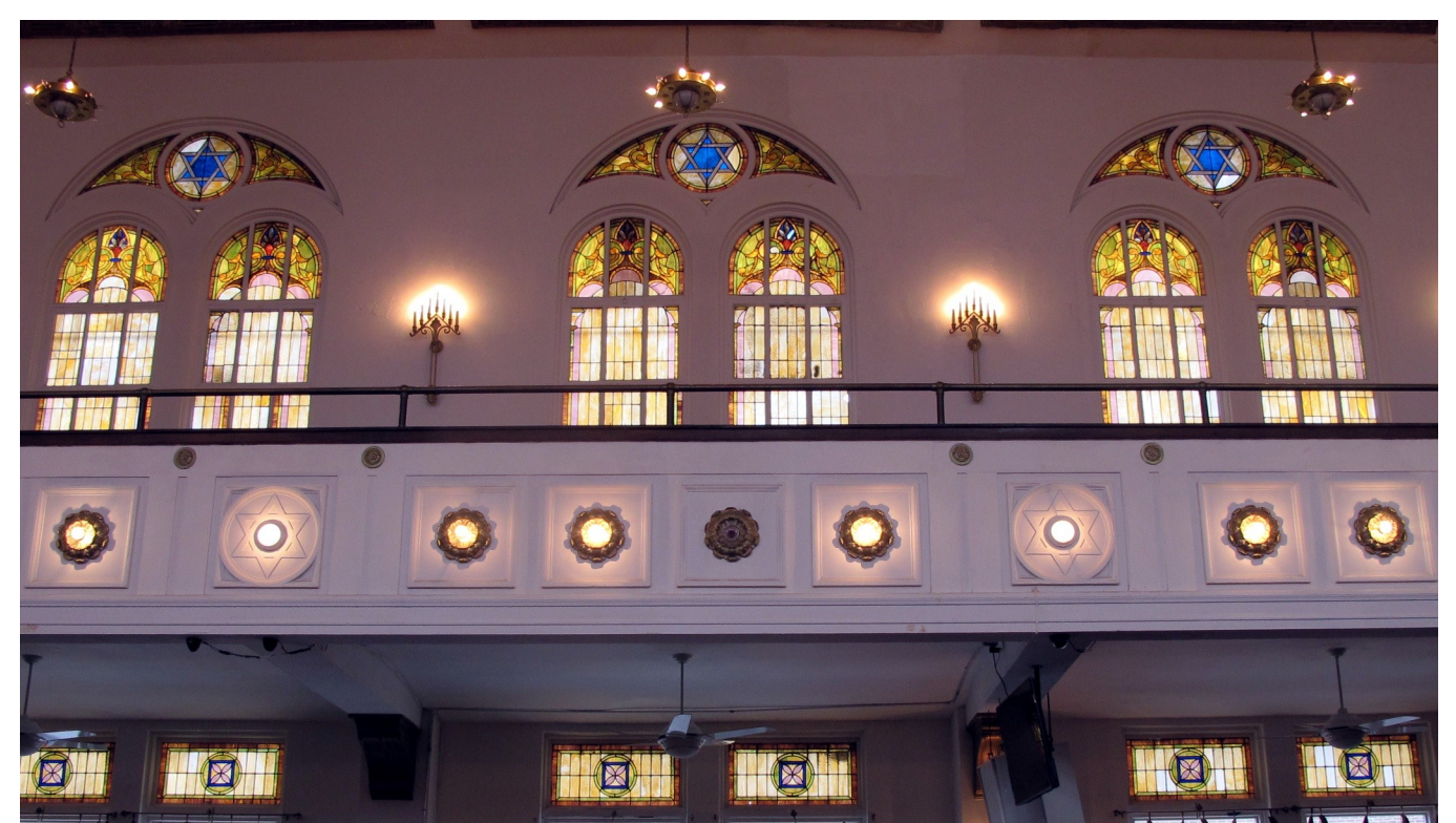
The interior of the former synagogue, now church, includes an unusual cantilevered balcony that eliminates the need for intrusive columns. Though the building became a Christian house of worship in 1954, the congregation has preserved the Torah ark and other Jewish symbols on the interior.