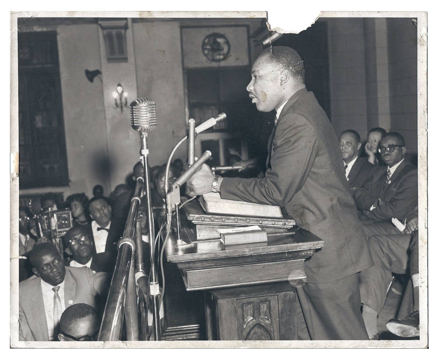
King preaching at Stone Temple Baptist Church ca. 1966.