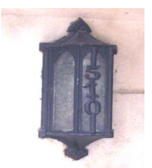
Additional building details found in the Surf-Pine Grove District.