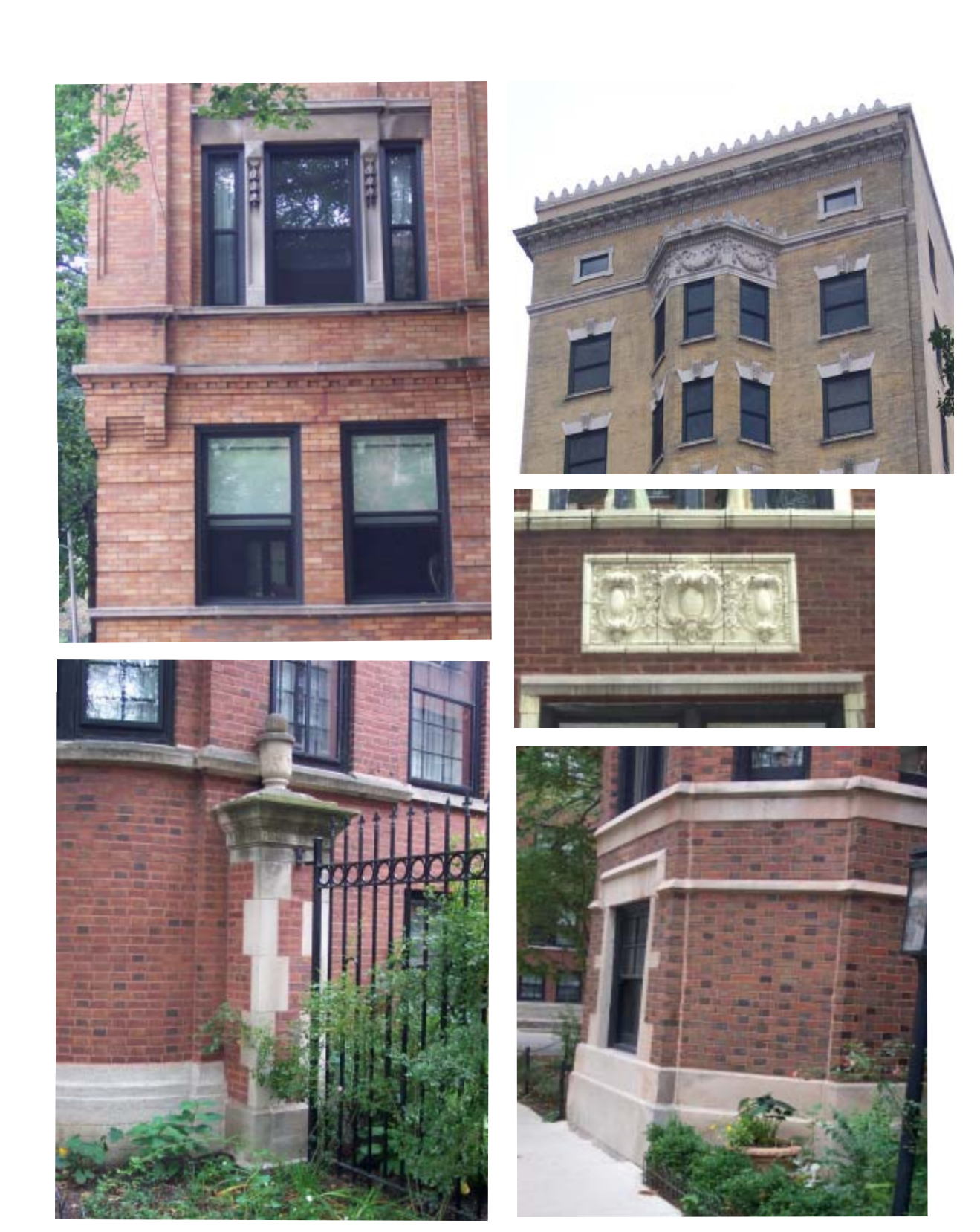
The buildings in the Surf-Pine Grove District has a plethora of beautifully executed details in a variety of traditional building materials, including brick, stone, decorative metal, wood, and terra cotta.