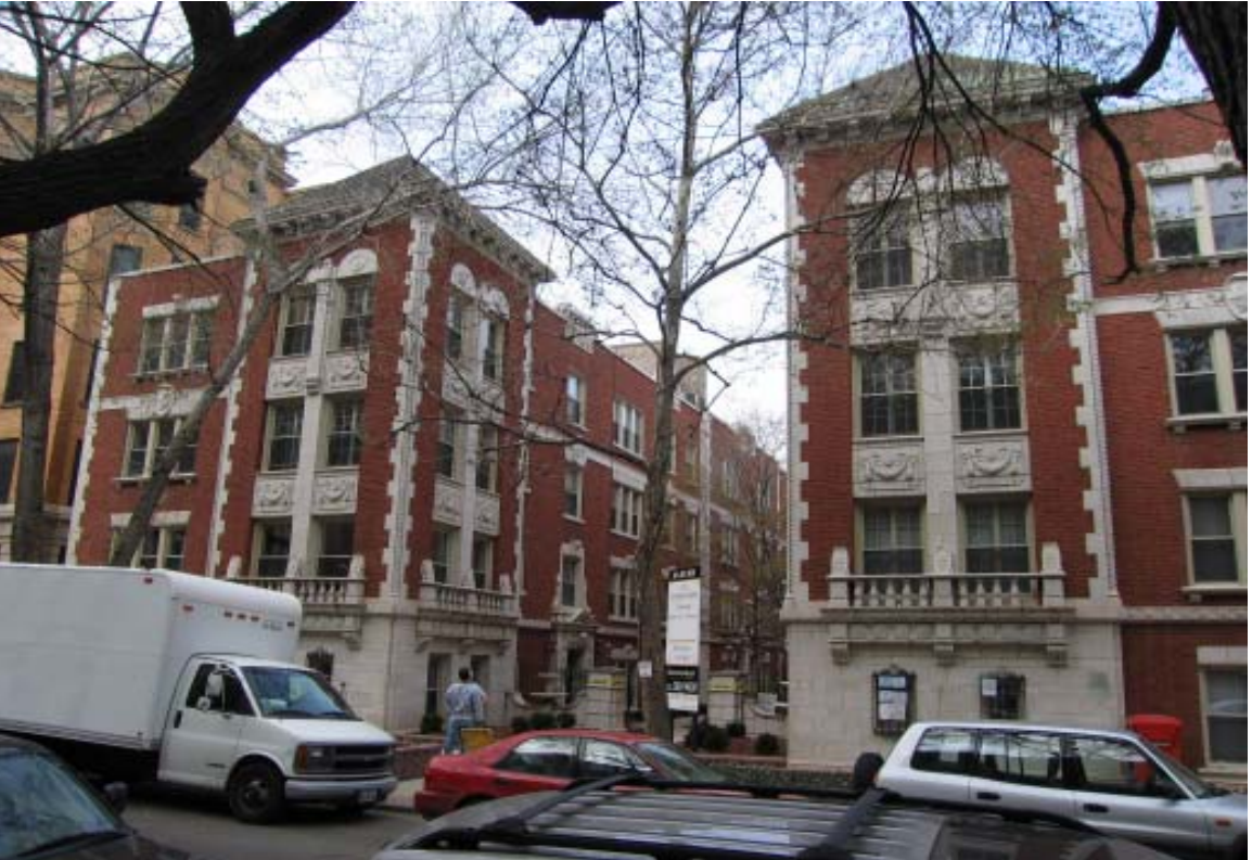
The Surf-Pine Grove District contains several very fine corner and courtyard apartment buildings. Two examples are (top) the corner apartment building on the southeast corner of W. Surf St. and N. Pine Grove Ave., designed in 1908 by N. Hallstrom; and (bottom) the courtyard apartment building at 540-48 W. Surf St., designed in 1928 by Raymond J. Gregori.