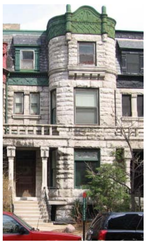
Details of the graystone row houses on N. Pine Grove Ave.