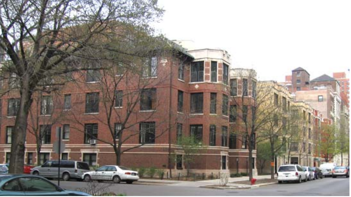
The Surf-Pine Grove District consists of a mixture of both low-rise and tall residential buildings. Top: N. Pine Grove Ave., looking northwest. Bottom: W. Surf St., looking east.