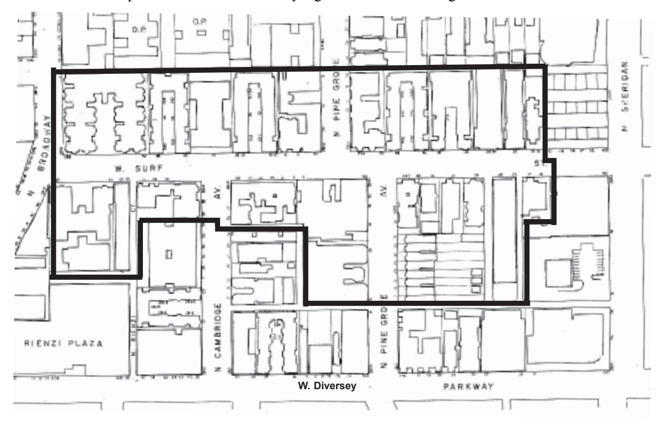
Surf-Pine Grove District boundaries

The Township of Lake View was officially organized in 1857. Its original boundaries stretched