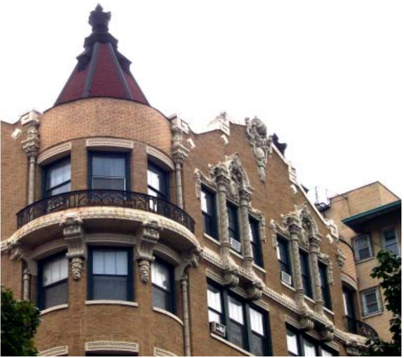
The District's buildings are ornamented with especially handsome terra-cotta detailing.