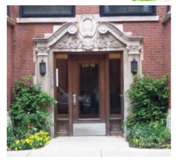
The Surf-Pine Grove District's buildings are especially noteworthy for the quality and variety of their building entrances.