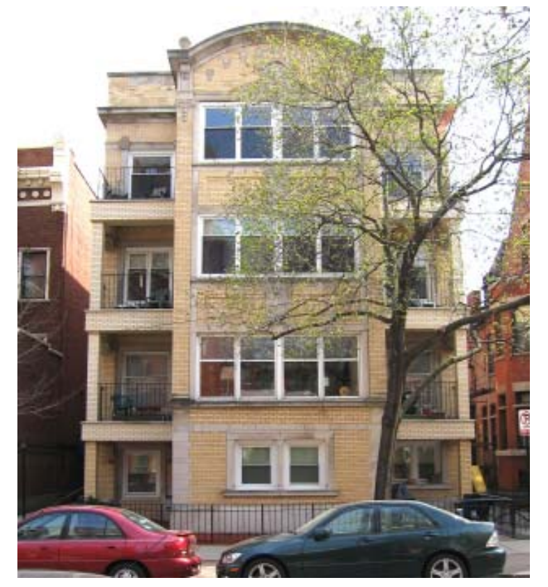
Top left and right: The Remey threeflat at 415 W. Surf St., built in 1910, and a detail of its finely executed brickwork.