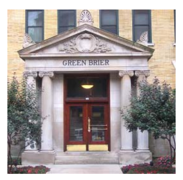
Additional building entrances in the District.