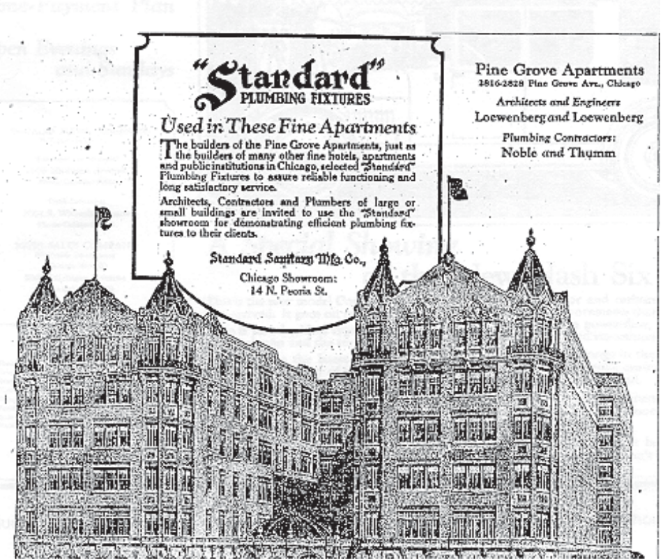
Top: A historic photograph of the Commodore Apartments at 550 W. Surf St. soon after its construction in 1897. Bottom: a 1920s advertisement, published in the Feb. 25, 1923, edition of the Chicago Tribune , featuring the Pine Grove Apartment Hotel at 2816-28 N. Pine Grove Ave..