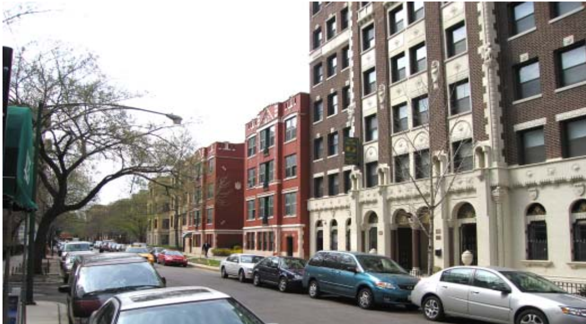
Opposite page: The Surf-Pine Grove Distict is located on the 400- and 500-blocks of W. Surf St. and the 2800-block of N. Pine Grove Ave. in the Lake View neighborhood on Chicago's North Side.

Top and bottom: Two streetscapes within the District.