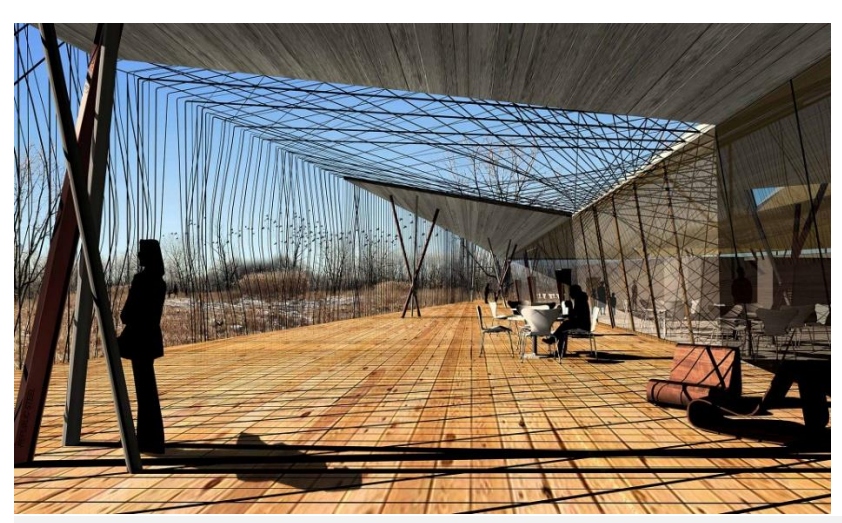
Figure 2.9. Ford Calumet Environmental Center. Copyright by Studio Gang Architects

The Chicago Department of Environment (DOE) and the State of Illinois partnered to develop a new Ford Calumet Environmental Center (FCEC) near 130th Street and Torrence Avenue. The center will be a regional hub for research, programming and stewardship. The proposed building will have many functions, including but not limited to being an educational resource on the industrial, cultural and ecological heritage of the area and serving as an operational base for research activities, environmental remediation and ecological rehabilitation, as well as a base for volunteer stewardship throughout the area. Prior City of Chicago studies stated that the center could generate over 100,000 visitors per year.