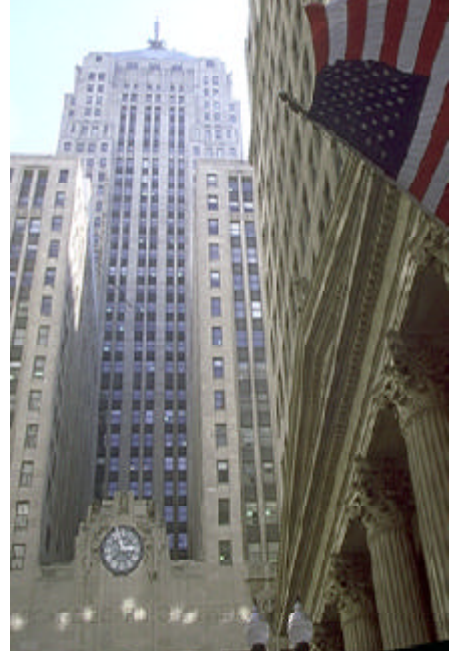
June 2003 Final Report