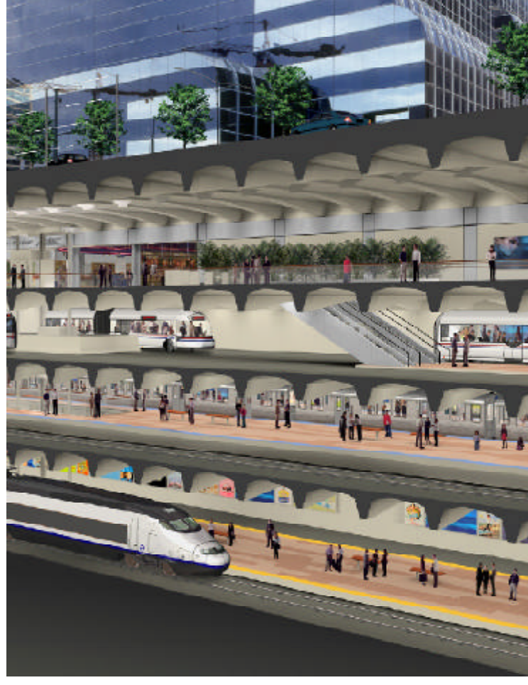
Figure 3.4 Ensure transit and inter-city access to the Central Area to provide a clear alternative to driving.