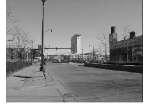
Figure 3.1 Cermak Road today