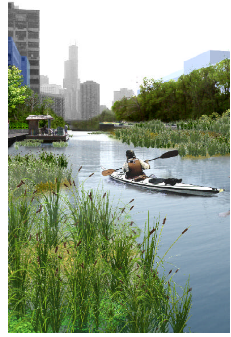
Figure 3.5 Create new parks, greenways and a continuous riverwalk.