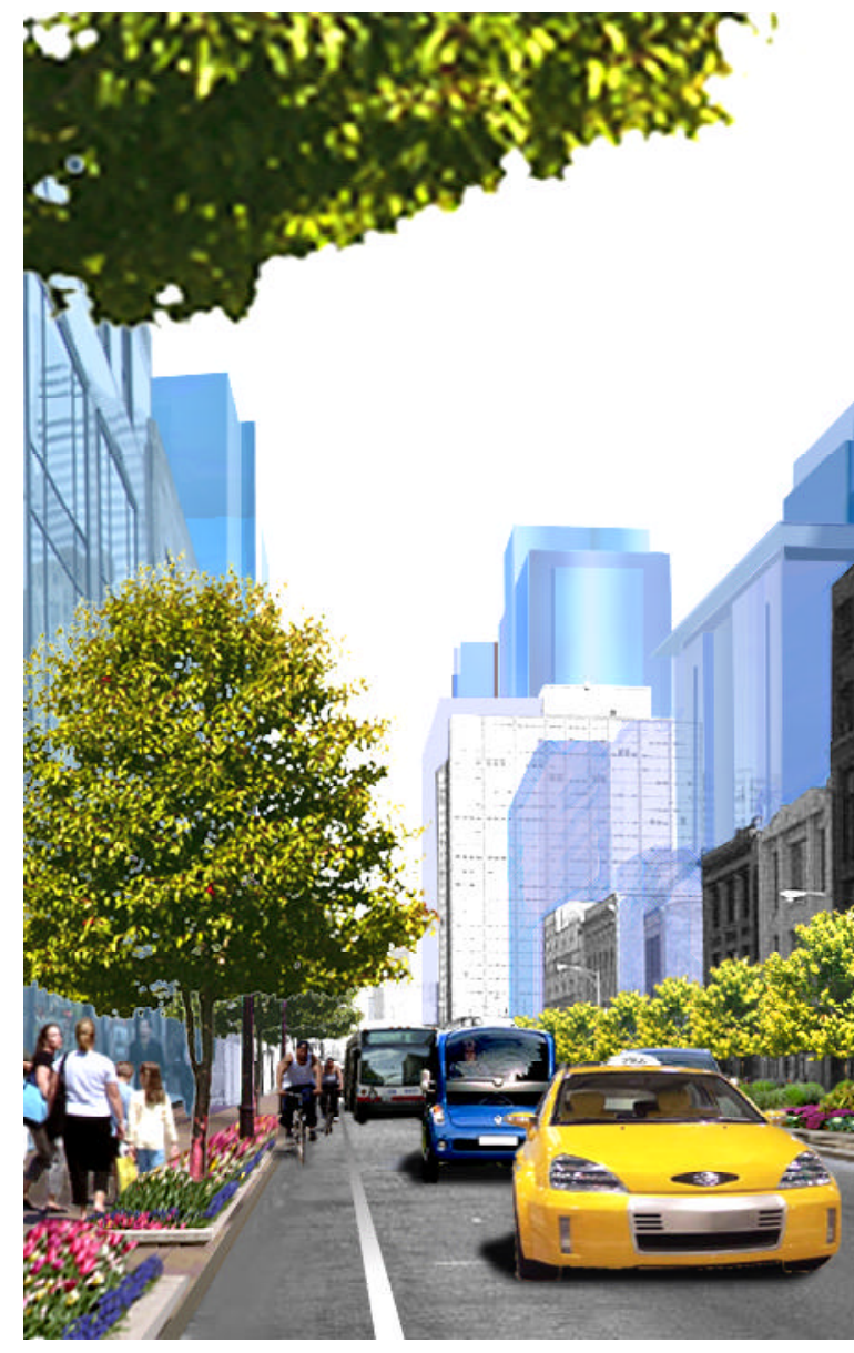
Figure 3.3 Encourage the development of a new generation of energy efficient buildings and infrastructure.