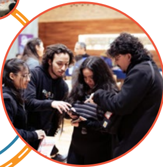
Community Open House

March 5th 2024 Brighton Park Community Campus/ Park District HQ