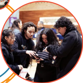
Community Open House March 5th 2024 Brighton Park Community Campus/ Park District HQ