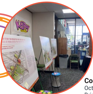
Community Exhibition October 2024 Brighton Park Library Branch