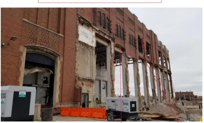
NEARLY 50% OF THE TURBINE BUILDING HAS BEEN DEMOLISHED AT THE EAST END OF THE BUILDING. THE MASONRY HAS BEEN REMOVED EXPOSING THE STEEL CONNECTIONS AS WELL AS LEAVING BRICK UNSUPPORTED AT NEAR A 3 STORY HEIGHT.

Protecting the public health and safety of residents in all communities remains the City of Chicago's top priority. Following a lengthy evaluation and structural analysis of the remaining buildings on the site of the former Crawford Power Generating Station, the DOB has determined that, in the interest of public safety, the turbine structure is unsound and needs to be removed immediately. It is expected that the demolition of the turbine structure will take approximately one to two days, weather permitting.