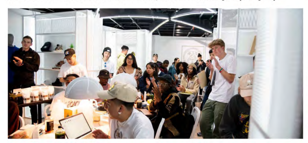
Nike School Chicago

A home for BIPOC artists, creatives, and community in Wicker Park, Chicago IL. (In Progress)