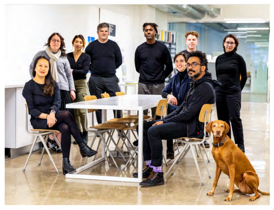
Future Firm Architecture and Design Research. Chicago IL.