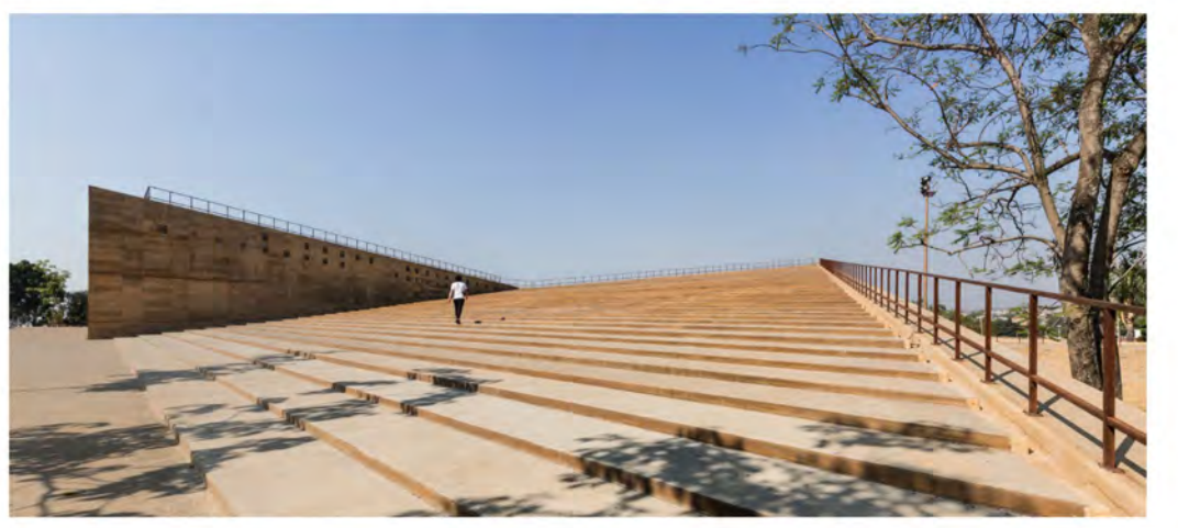
Teopanzolco Cultural Center

A highly energy efficient office building. Houston, TX (2019)