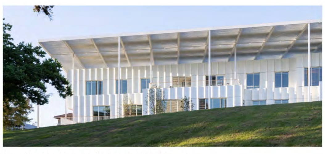
New Headquarters of Houston Endowment

"Student Union" for Nike School Chicago in Chicago IL. (2022)