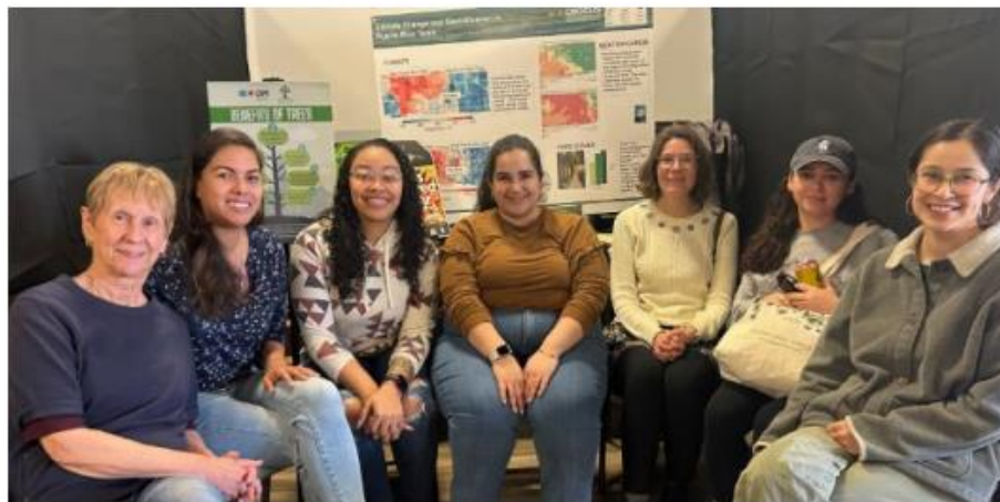
Tree Stewardship Through Storytelling with Puerto Rican Cultural Center