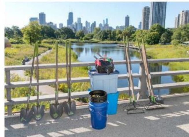
Tree Planting Toolkits for Communities