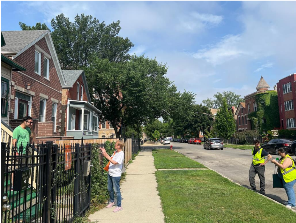
The Puerto Rican Cultural Center engages residents in Humboldt Park

2322 Trees Planted 609 Requests in 2025 1029 Trees Inventoried