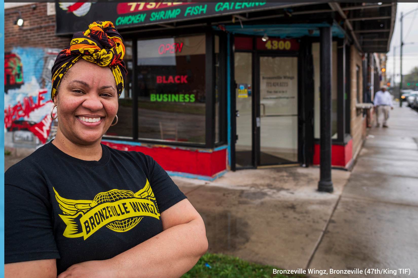
Bronzeville Wingz, Bronzeville (47th/King TIF)