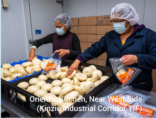
Oriental Kitchen, Near West Side (Kinzie Industrial Corridor TIF)

SBIF applications are accepted during specific 30-day rollout periods for individual TIF districts. Applications must be submitted to DPD's program administrator, SomerCor. For more information or application assistance, visit www.somercor.com/sbif .