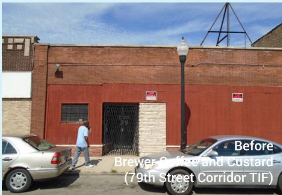
Before Brewer Coffee and Custard (79th Street Corridor TIF)