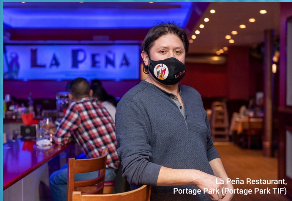
La Peña Restaurant, Portage Park (Portage Park TIF)

"All of this work improved the restaurant's reputation, image and customer service, giving us the ability to employ more people and give back to the community."