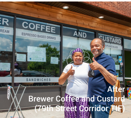
After Brewer Coffee and Custard (79th Street Corridor TIF)