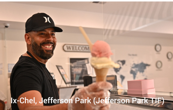
Ix-Chel, Jefferson Park (Jefferson Park TIF)