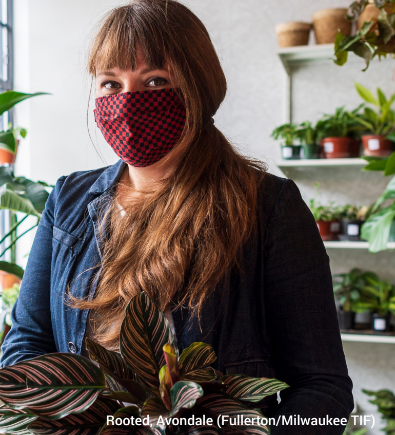
Rooted, Avondale (Fullerton/Milwaukee TIF)

SBIF program participants can receive grants covering between 30 percent and 90 percent of eligible project costs. The grants do not have to be repaid.