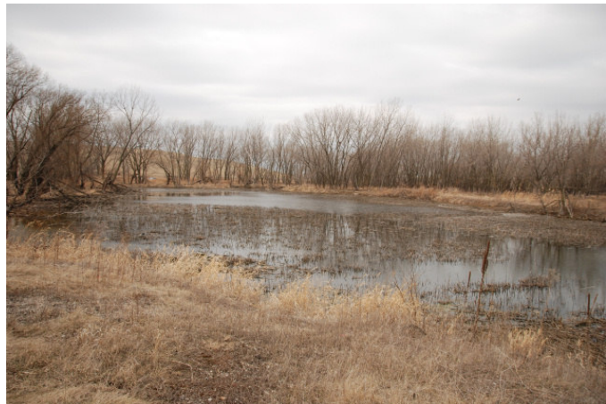
The water control structure enables site managers to adjust water levels for Hegewisch Marsh during periods of drought or high precipitation, thereby maximizing suitable habitat for marsh species. The water control structure intended for Big Marsh also has the potential to reduce or prevent flooding of nearby roads.