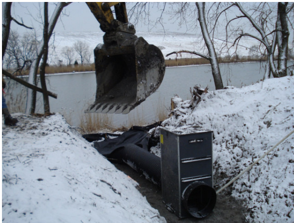
Installation of water control structure at Hegewisch Marsh in 2008.