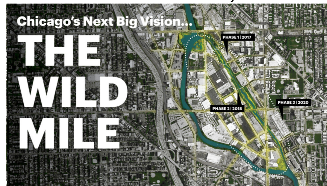
Wild Mile, Near North Side, $500,000